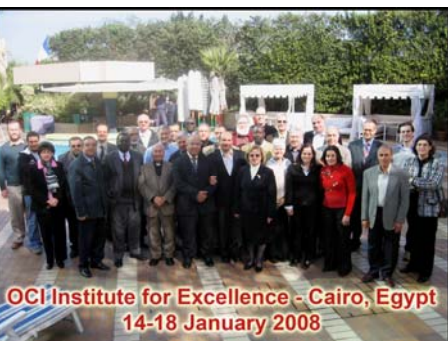
OCI Institute for Excellence - Cairo, Egypt 14-18 January 2008

ETSC was privileged to host the OCI Institute for Excellence in Cairo this year. Leaders from 18 Middle East theological institutes and international organizations came together for this annual week-long event, focusing on building leadership skills among these key centers of training in the region.