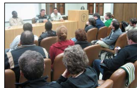
Students speaking with Wake Forest group