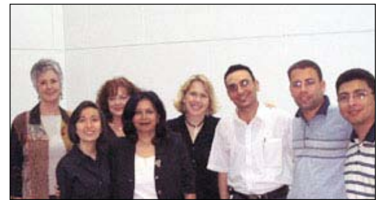
FPC Houston friends visit ETSC students