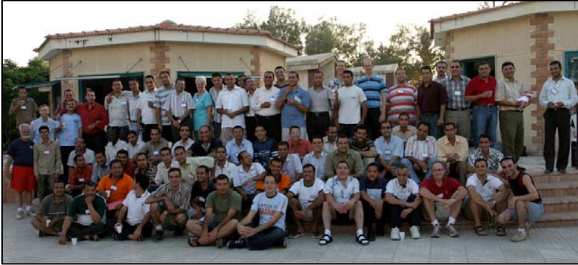
Left: Ordination students and faculty at Fall Retreat. Right: M.A.T.S. students and faculty.